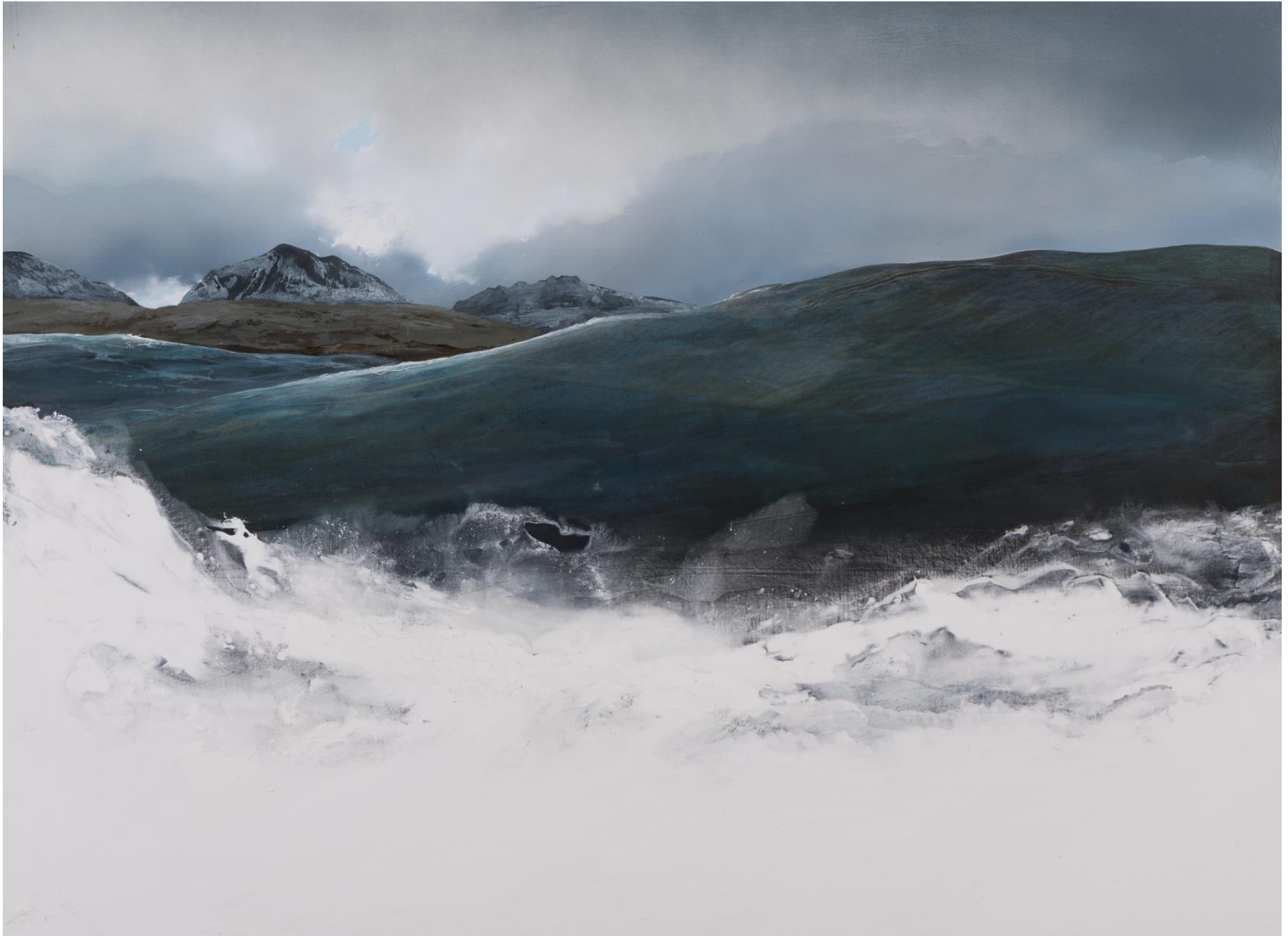
Jura island 97 x 130cm acrylic on canvas