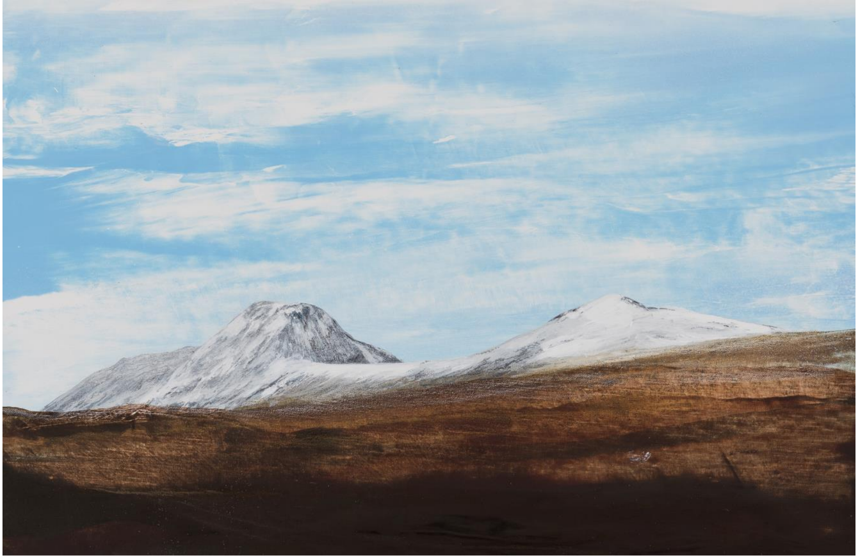
Arran Island 37 x 55 cm acrylic on canvas