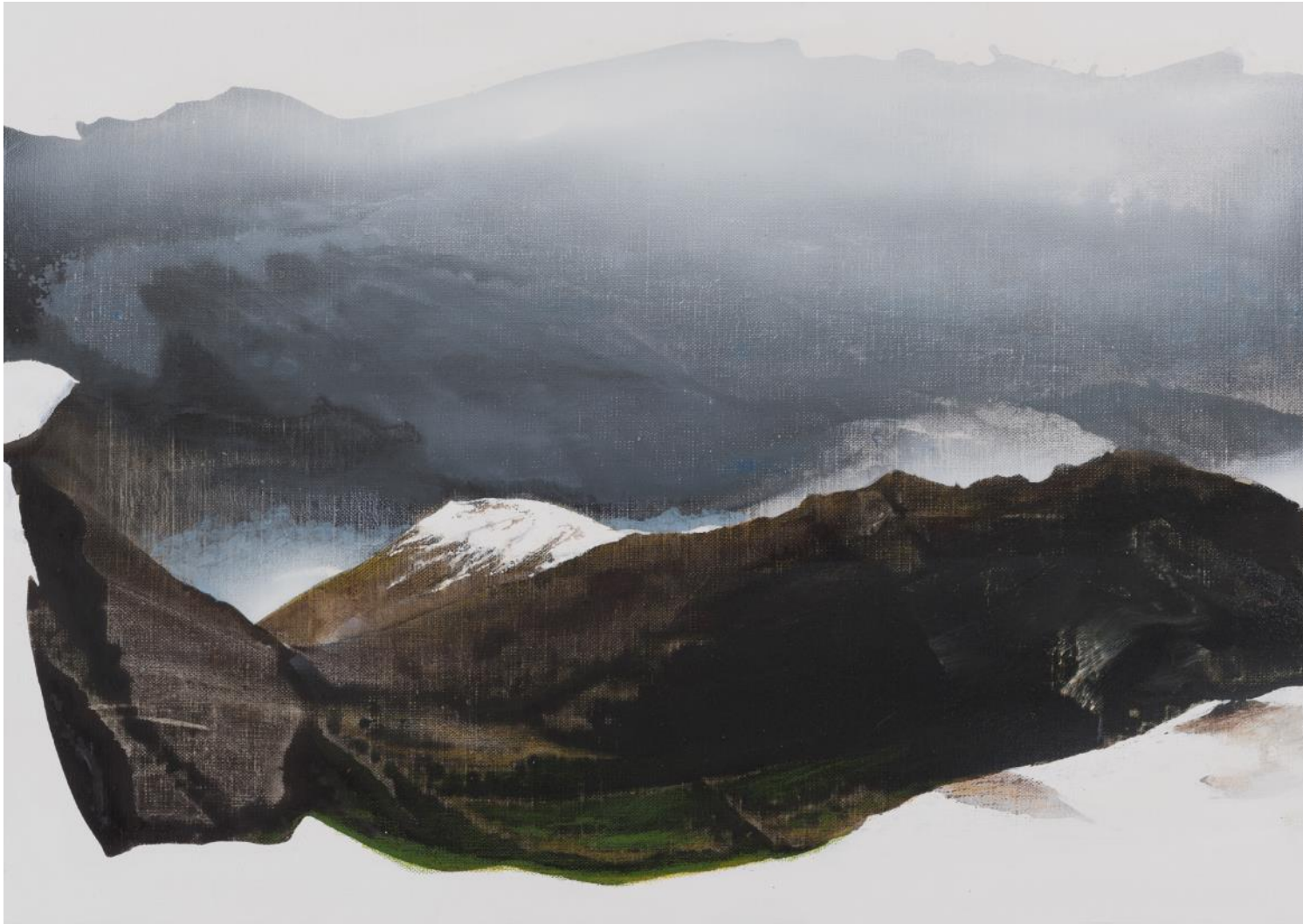
Dirty Sky on Ben Nevis 38x 55 cm