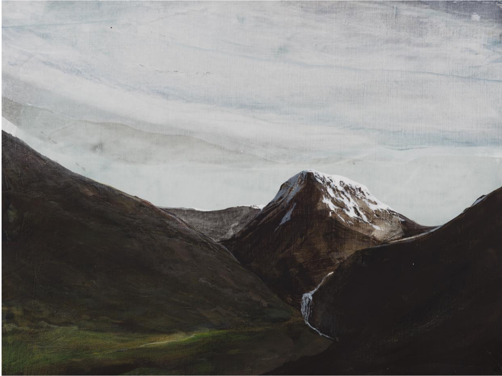
Ben Nevis Country 46 x 61 cm acrylic on canvas