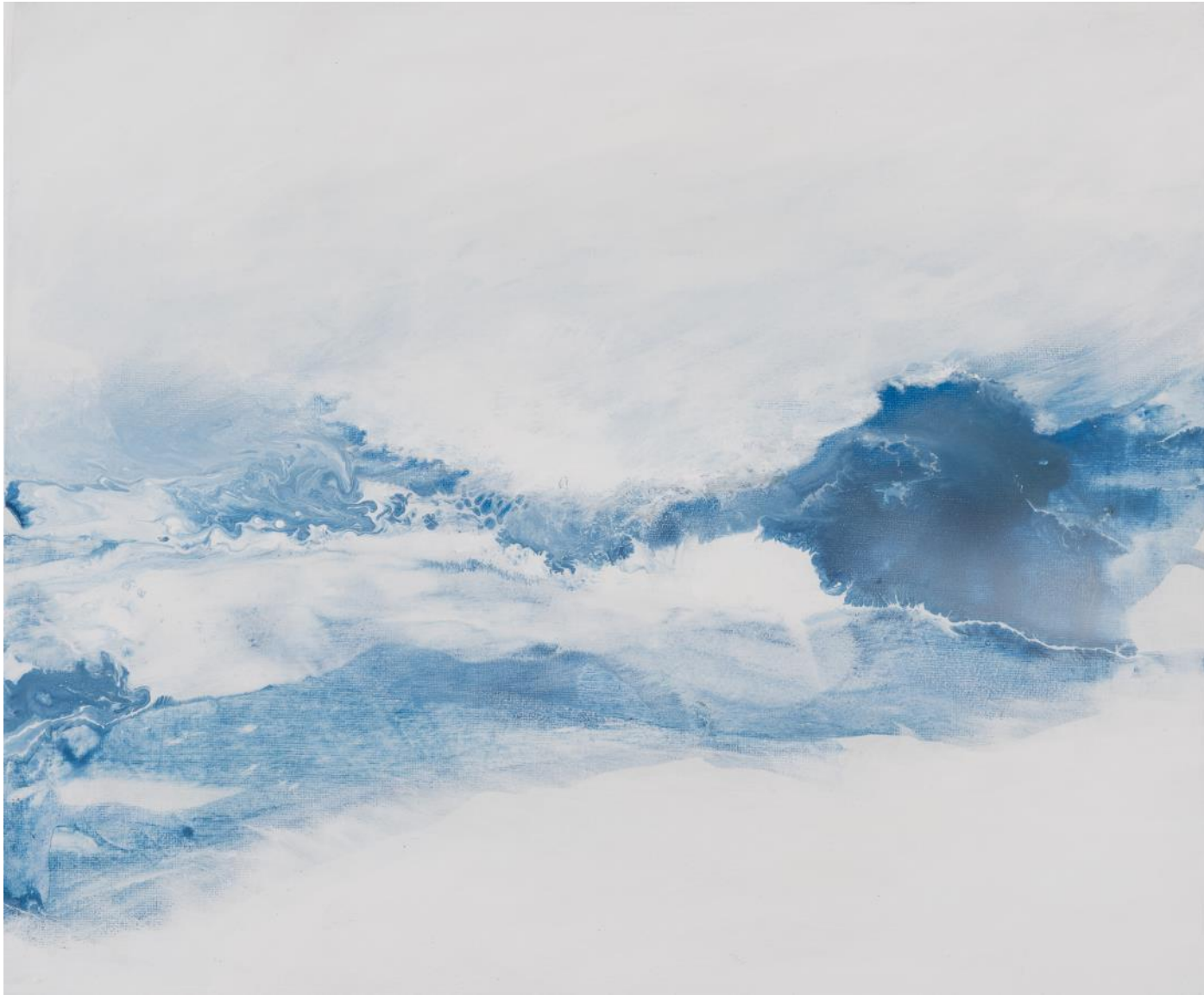
Ocean Writing 38 x 46cm acrylic on can-