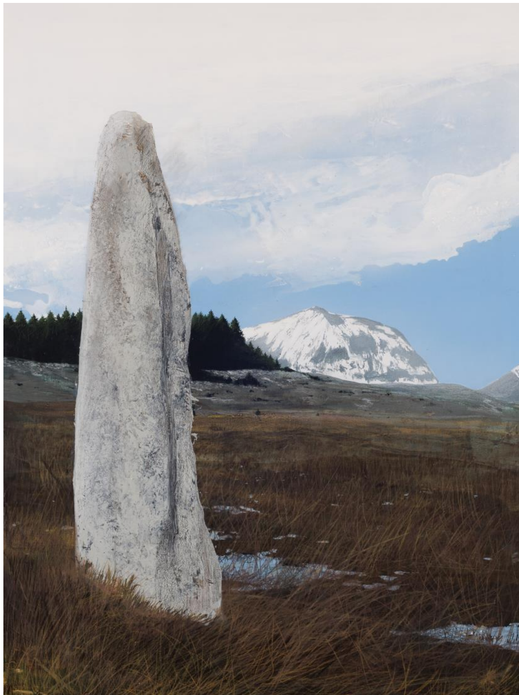
Pittura is a cosa mentale 97 x 130 cm acrylic on canvas