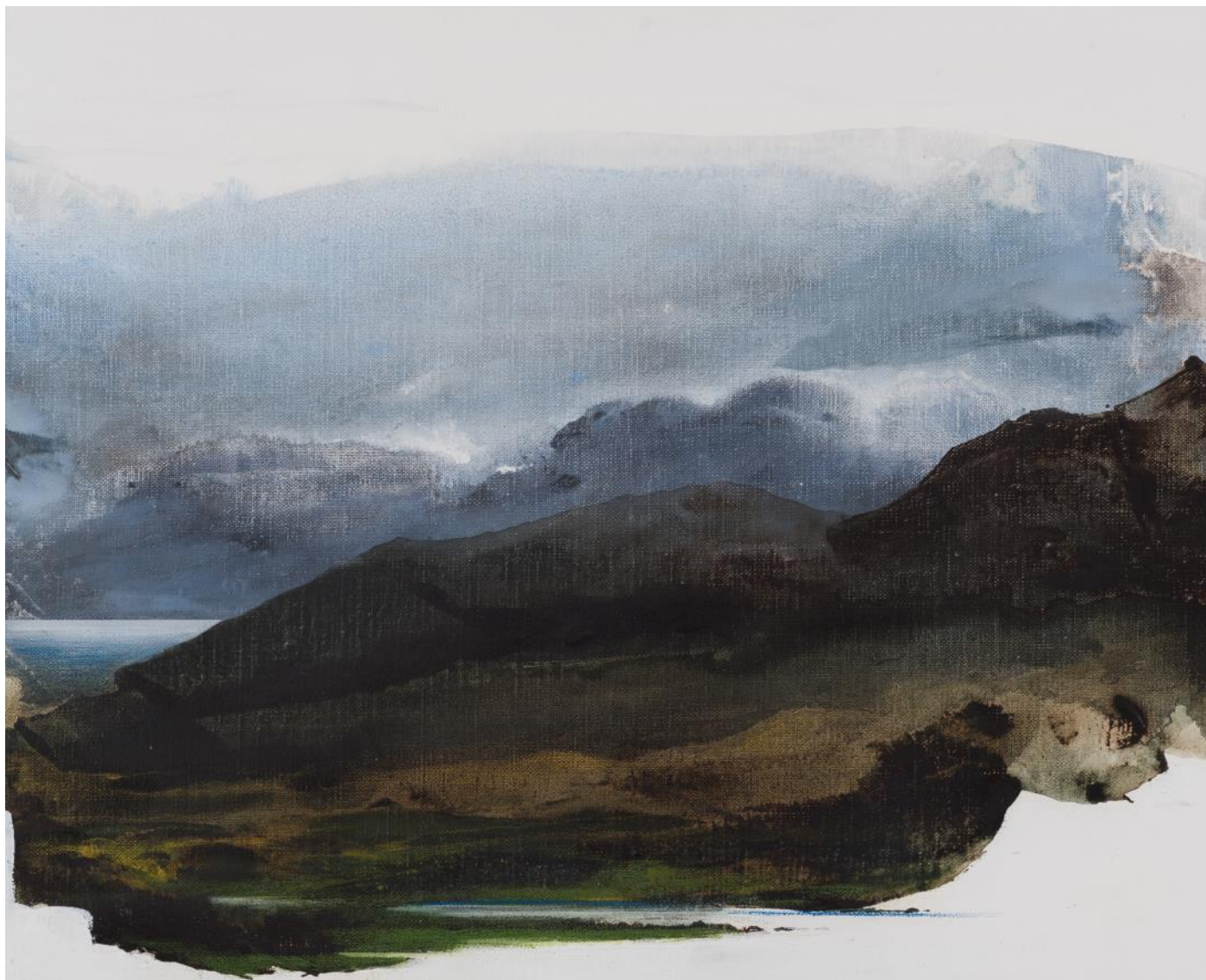
Arran Island 37 x 55 cm acrylic on canvas