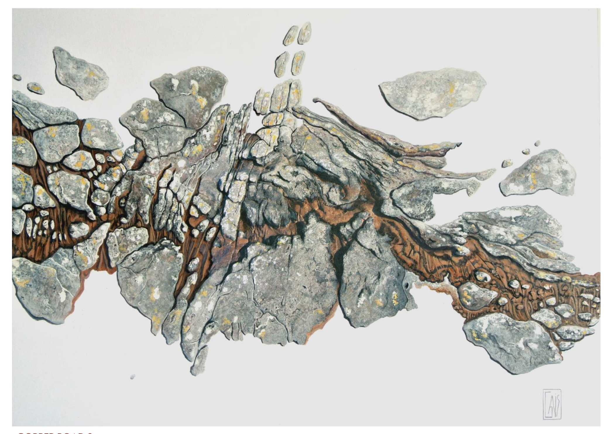
COPPER ROAD 2 Photo and ink on paper 65 x 45 cm 2017