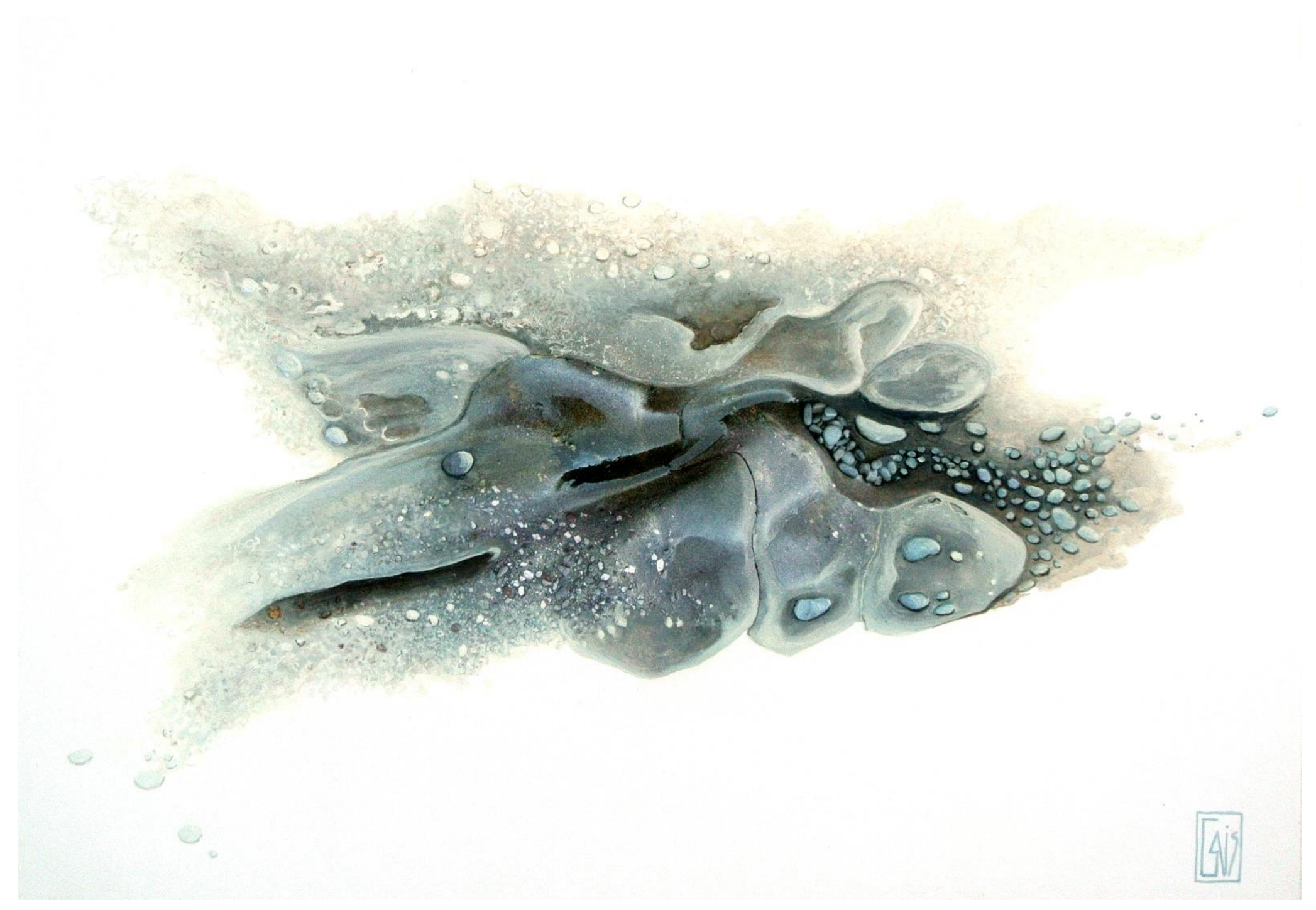
BLUE SYMPHONY Photo and ink on paper 60 x 45 cm 2017