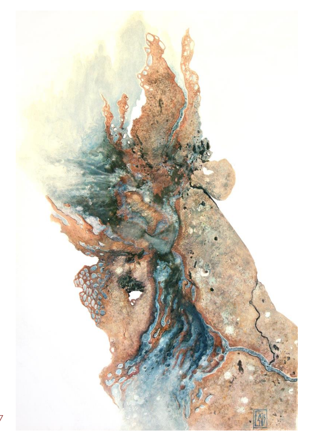
WATER SUBLIMATION Photo and ink on paper 45 x 60 cm 2017