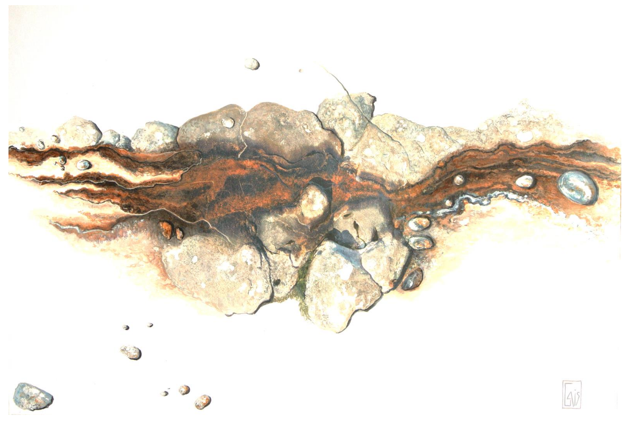
COPPER ROAD 1 Photo and ink on paper 60 x 45 cm 2017