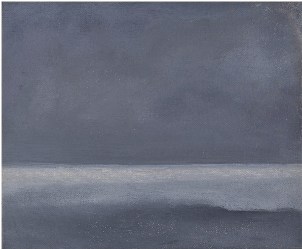
The Sound of Sleat: Summer Night, II Oil on canvas Romasaig Jun 70-Jul 70 10" x 12", (25.5 x 30.5cm) £6,700