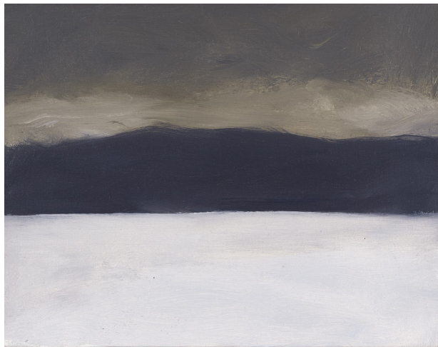
The Search: Variations, Black and Light, III Oil on canvas Romasaig Jul 81 12" x 16", (30.5 x 40.65cm) £7,700