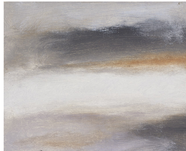
Sea Light, II Oil on canvas Romasaig Aug 80 8" x 10" (20.321 x 24.4 cm) £6,000