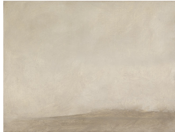
Winter Series:15 Oil on canvas Edinburgh Apr70-May70 12" x 16", (30.5 x 40.64cm) £8,200