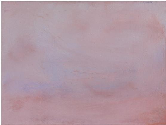
The Search: Mourning Blues II Oil on canvas Romasaig Jul 81 6" x 8", (15.25 x 20.32cm) £6,400