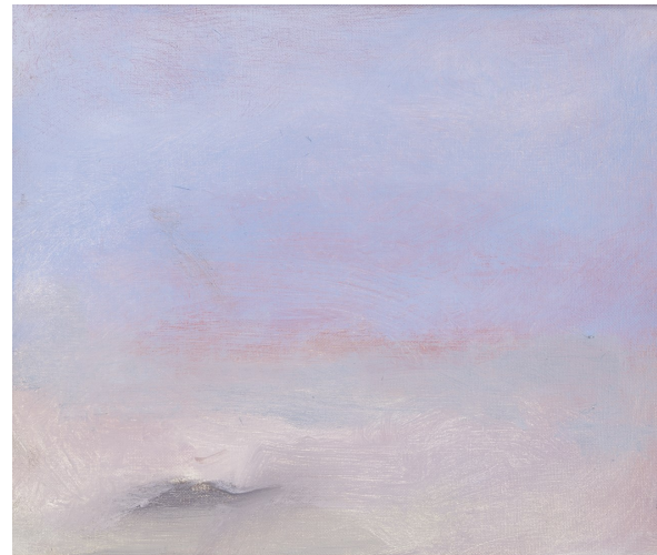
The Search: Mourning Blues I Oil on canvas Romasaig Jul 81 10" x 12", (25.5 x 30.5cm) £6,700