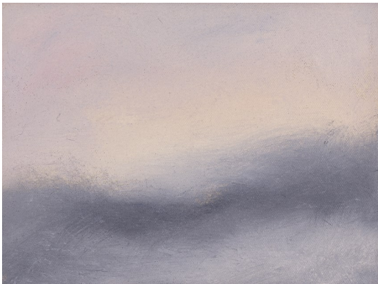
A walk on the Moors Oil on canvas New York May 77 6" x 8", (15.25 x 20.32 cm) £6,000