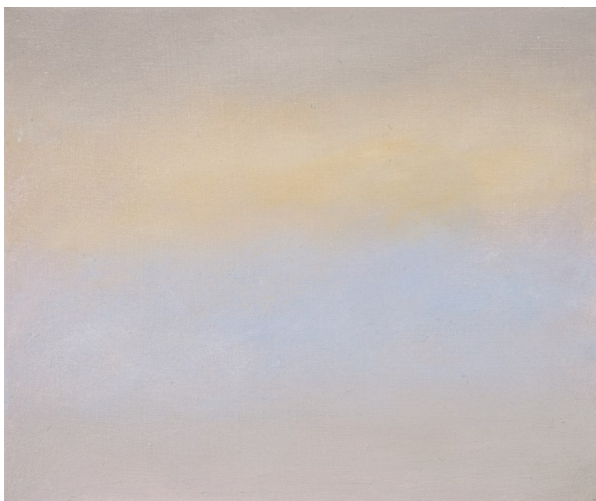
Morning: Yellow and Blue Oil on canvas Romasaig Mar 75—May 75 10" x 12", (25.5 x 30.5cm) £6,700