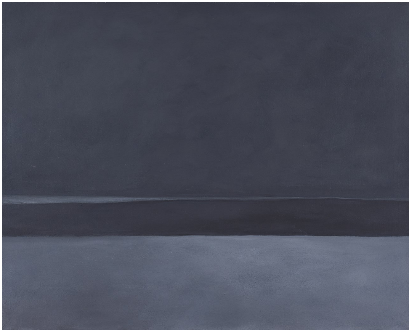
The Sound of Sleat: June Night, IX Oil on canvas Romasaig, Sep 70-Oct 70 32" x 40" (81.3 x 102cm) £17,840