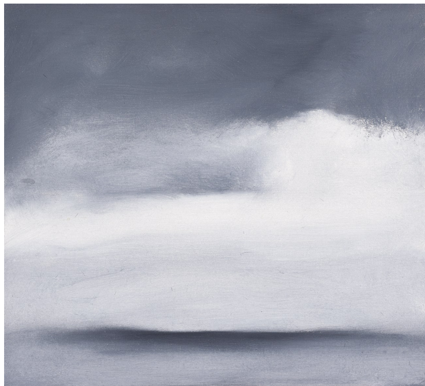
Silver Sunday Oil on canvas Romasaig Oct 81 16" x 18" (40.65 x 45.72 cm) £9,000