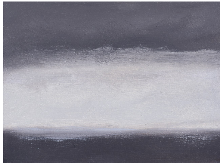
The Search: Variations, Umber and Black, II Oil on canvas Romasaig Jul 81 14" x 18", (35.56 x 45.72cm) £8,400