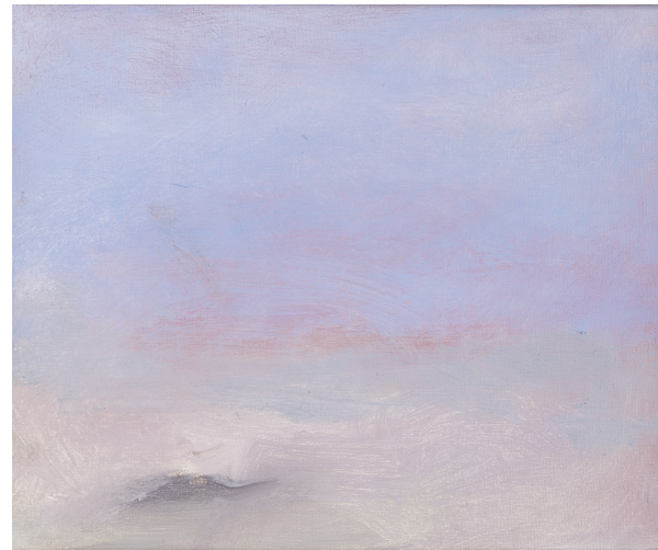
The Search: Mourning Blues I Oil on canvas Romasaig Jul 81 10" x 12", (25.5 x 30.5cm) £6,700